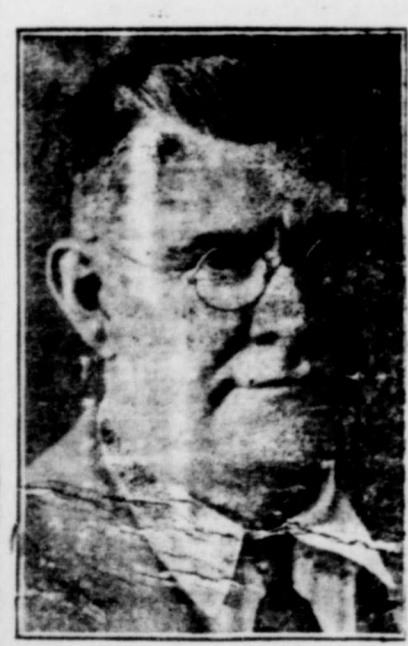
To the Voters of Taylor Co.:

It is impossible for me to see each of you personally, so I take this method of thanking you for your loyal support and hearty co-operation in the past. I have tried hard to make you an efficient, courteous, and appreciative servant. You know how well I have succeeded. If my work has pleased you, I most humblyobeg for your support in the coming primary. If you honor me by re-electing me your County Superintendent, I promise the same courteous and careful attention to the needs of the office that I have given in the past.