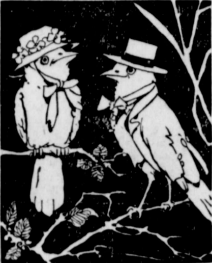
"We Are a Sociable Crowd," Said Mrs. Blackbird.

then, oh, chack, chack, chack," the birdlings answered.