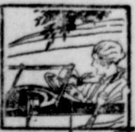
No more kitchen worries

Picture the benefits and advantages of this Modern Kitchen Necessity. It means fewer hours in the kitchen, because it is not necessary to "cook" in the old-fashioned sense of the word. Merely prepare the meals, put them in the oven, set the Automatic Timer and Heat Control and your food will be ready at any given time—perfectly prepared.