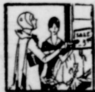
Cooks while Mother shops

The New Model 1930 Hotpoint Electric Range combines all the features of the Ideal Christmas Gift, plus the knowledge that you are giving hours and hours of happiness for years to come.