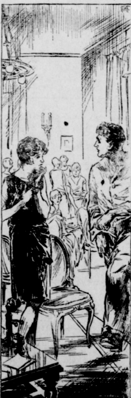
"And things had been going so well!"

By a wisely-placed "extension" or two, and perhaps a rearrangement of the equipment you already have, an expert telephone man can often double the convenience of your telephone service.