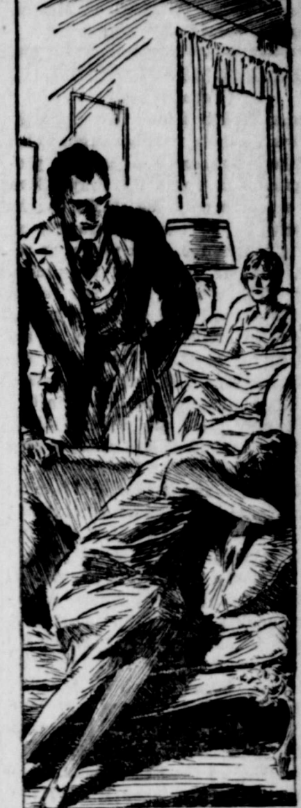
"And no-nobody else has asked me!"

By a wisely-placed "extension" or two, and perhaps a rearrangement of the equipment you already have, an expert telephone man can often double the convenience of your telephone service.