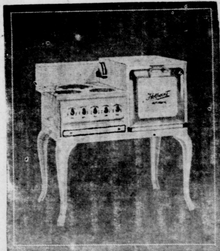
The New All-White Hotpoint Electric Range... $132.50

... this new "low priced" electric range will cook for you