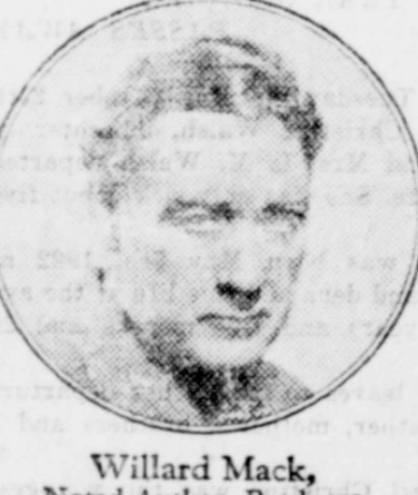
Noted Author, Producer

LUCKY STRIKES give the greatest pleasure-Mild and Mellow, the finest cigarettes you ever smoked. Made of the choicest tobaccos, properly aged and blended with great skill, and there is an extra process -"IT'S TOASTED"-no harshness, not a bit of bite.