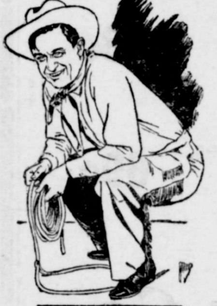
Another 'Bull' Durham advertisement by Will Rogers, Ziegfeld Folies and screen star, and leading American Humorist. More coming. Watch for them.

NEW YORK is building some more of those subways under the ground. No use building any more, people can't find their way out of the ones they got now. There's people down underground in New York that haven't been up for years. New York people are just like a lot of Gophers; every time they see a hole in the ground they grab a nickel and duck for it. If they keep on living underground, in two more generations their children will have fur like a rat What's this Subway got to do with 'Bull' Durham? Nothing. What do people outside New York care about how New Yorkers live? Nothing. But there is an old saying that one half the world don't know how the other half live, so I am telling you how they live, not as an Ad but as a fact. Five million Ground Hogs in New York rush through life missing one Train and being shoved into the next. The real trouble is that they can't smoke 'Bull' Durham down there.