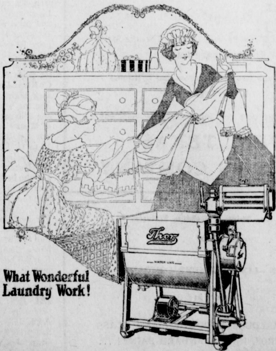
What Wonderful Laundry Work!

What a wonderful age we are fortunate enough to live in. What modern labor saving conveniences we enjoy in comparison to what our forefathers did. No longer do we have to make wash-day a