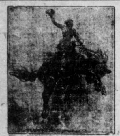
The lady brone and trick riding has always been a feature at the Ft. Worth Rodeo.

Varied entertainment will be the watchword of the Southwestern Ex position and Fat Stock Show, which will be held at Fort Worth March 5 to 12. With an exhibition of blooded livestock that promises better than