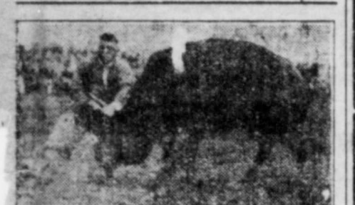
BULLDOGGING in the Rodeo at Ft. Worth. world's record has been broken several times.

The eleventh-hour rush of preparation for the Southwestern Exposition and Fat Stock Show, to be held at Fort Worth, March 5 to 12, finds the plans of the management maturing more rapidly than in past