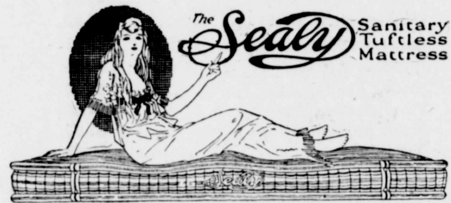
The mattress of "individual comfort"