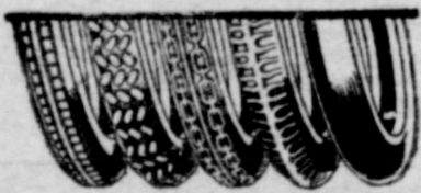
ROYAL CORD - NOBBY CHAIN - USCO - PLAIN

For best results—everywhere—U. S. Royal Cords.