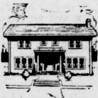
The Modern Colonial

☛ The latest designs are of the colonial type. We have a fine selection of these charming homes both in one and two story plans.