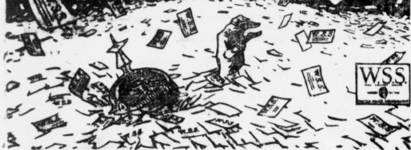
This space contributed for the Winning of the War by