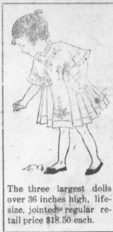
The three largest dolls over 36 inches high, life-size, jointed, regular retail price $18.50 each.

4 OF THE DOLLS TO BE GIVEN TO 4 LITTLE CHILDREN