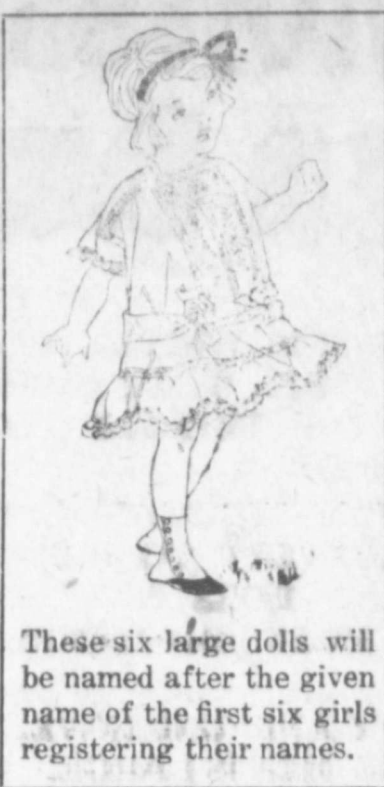
These six large dolls will be named after the given name of the first six girls registering their names.

If you have no child come in and register for some other child. Help some little girl win one of the beautiful dolls at Behrens-McMillen.