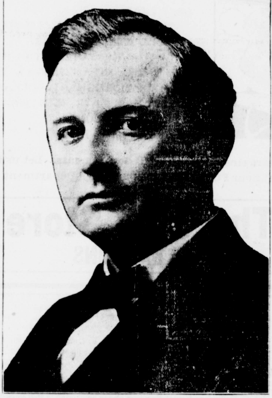
James E. Ferguson

in my opening speech I told the people that I was in favor of beginning at the little schoolhouse by the side of the country road, and in matters educational that of the greatest importance was that of the country school. And in pursuance of this platform pledge the Legislature passed what is known as the rural school bill. It provides in terms that a $1,000,000 for the two fiscal years should be appropriated for the benefit of schools situated in towns of less than 1000 inhabitants and having less than 200 situated in towns of less than 1000 inhabitants and having less than 200 pupils. Up to the time of the passage of this bill there were many rural precincts in Texas which on account of the low values in their districts were not able to maintain a school for longer than three and one-half to four and one-half months a year. By the advantages of this bill about 1400 country schools have been helped to longer