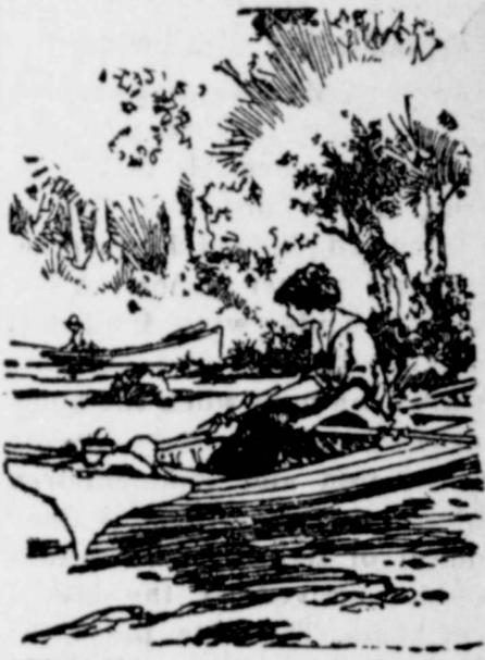
"Right Where I Wanted to Anchor."