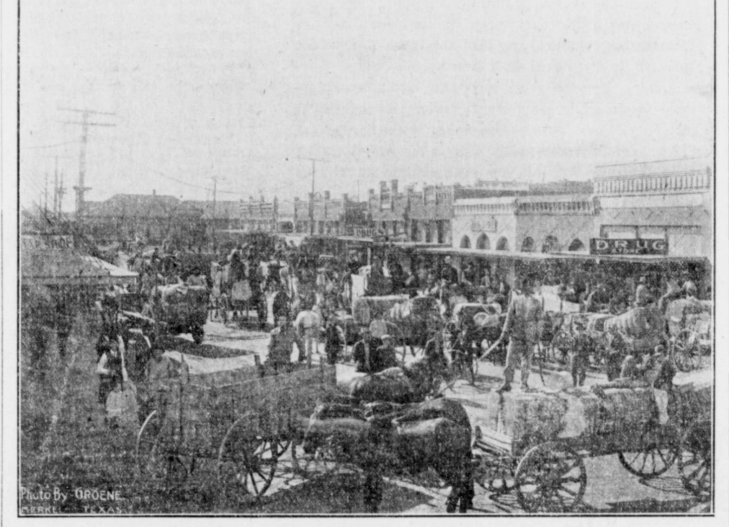
Looking down Edwards street in Merkel, Saturday, November 21, 1914, probably the busiest day of our cotton season. Over 600 bales of cotton were paid for by our two banks during the day and approximately 750 bales brought here from four o'clock in the morning until past midnight of the same day.

ber 31, at the Methodist Church Secretary.