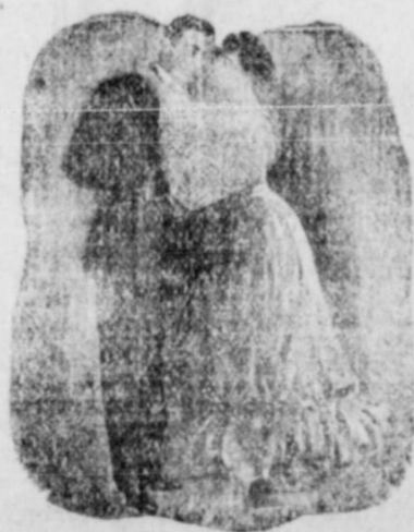
Dearie—Won't you buy my present of "Mack"

Ladies—A word to the wise is sufficient.