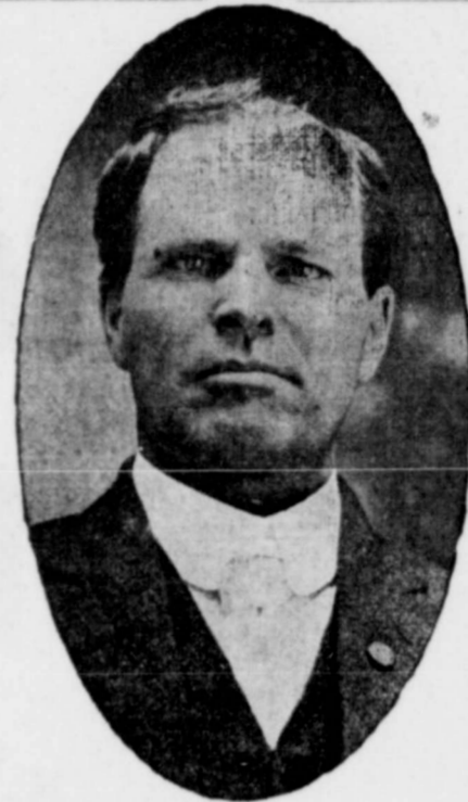
Subjects For the Methodist Pulpit For Next Sunday.