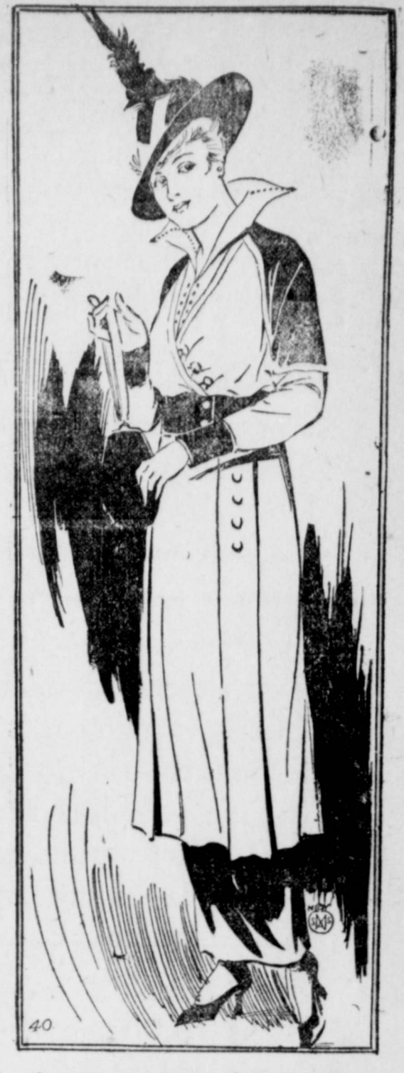
$25 SUIT $17.50