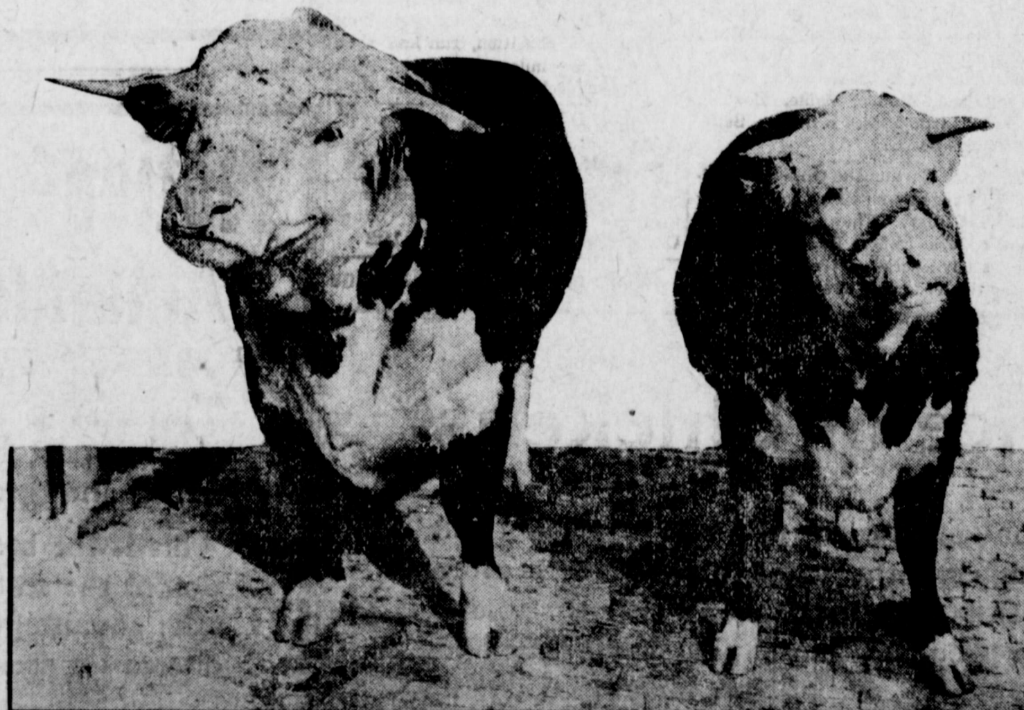
"VICTOR FAIRFAX" AND "BABY DOLL"

You can read about "Victor Fairfax" in another place. "Baby Doll" is 18 months old and has been shown at all of the leading stock shows of the south for a grand champion and is yet undefeated. The owner believes that she is the best cow in the south. This is a beautiful animal.