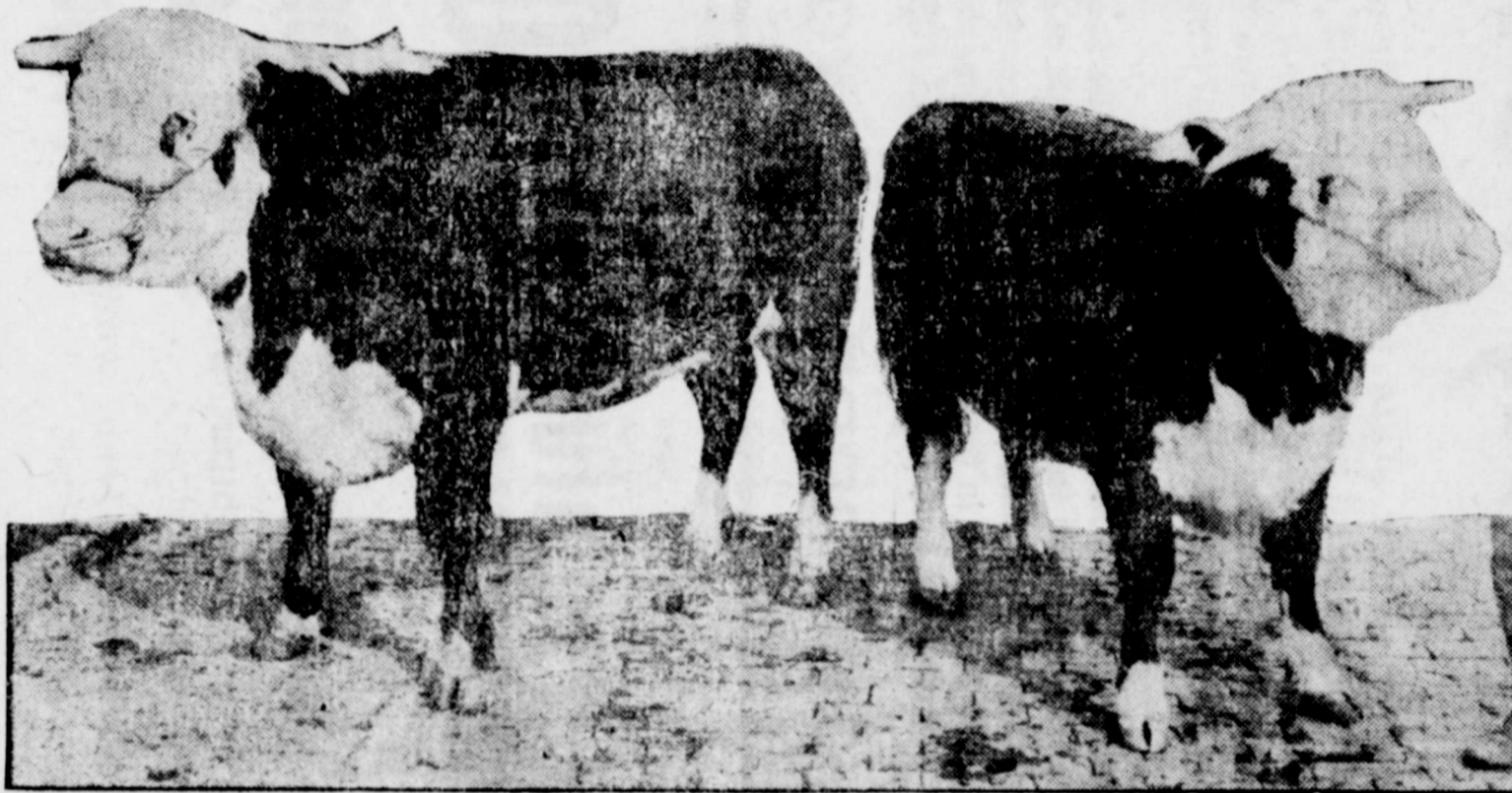
"PRINCE LAD" AND "DIXIE BILL"