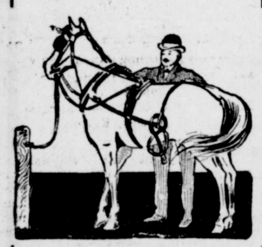
Figure With Us

are the kind you want for both your work stock and your buggy horse. WE KNOW WHAT WE put into our harness and know they are good.