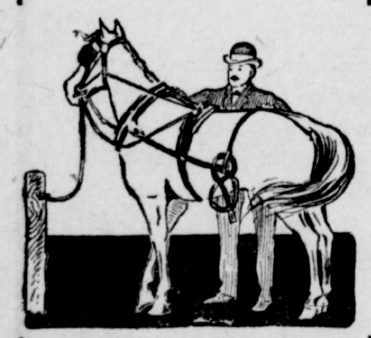
Figure With Us

are the kind you want for both your work stock and your buggy horse. WE KNOW WHAT WE put into our harness and know they are good.