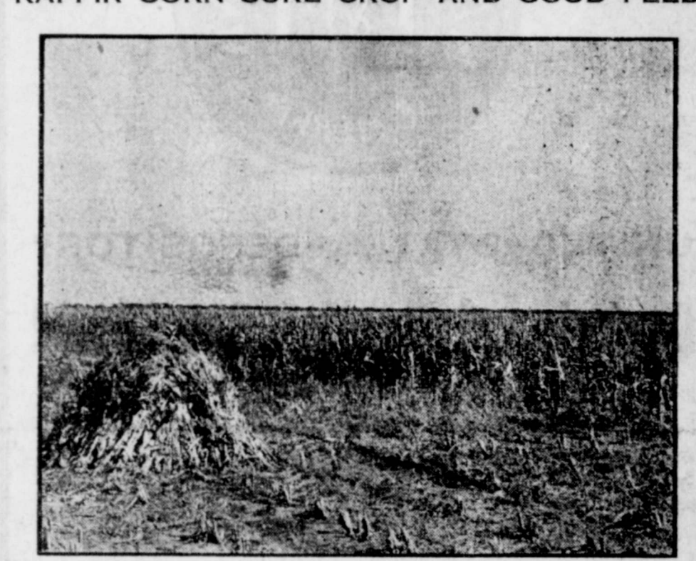
1911-A DRY YEAR-1911

This kaffir corn was raised by J. N. Teaff, 1 mile west of Merkel planted in March and received only two rains during the entire growing season and produced 2,000 pounds to the acre. His yield of milo maize was much better, making over 50 bushels to the acre, both crops at this average making a profit equal or better than a good cotton crop at the present prices. He cultivated over 200 acres and attended to a good bunch of stock.