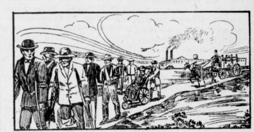
THE TEXAS CASUALTY LIST IS APPROXIMATELY 9,000 PER ANNUM.

There is no responsibility resting more heavily upon civilization than the care of those injured while turning the wheels of progress and the maintenance of those dependent upon employees killed in the pursuit of industry. There are killed during a year 350 people and 8,650 injured while in the employ of business and our industries bear a personal injury burden of a half million dollars per annum and it is reliably estimated that one-half of this