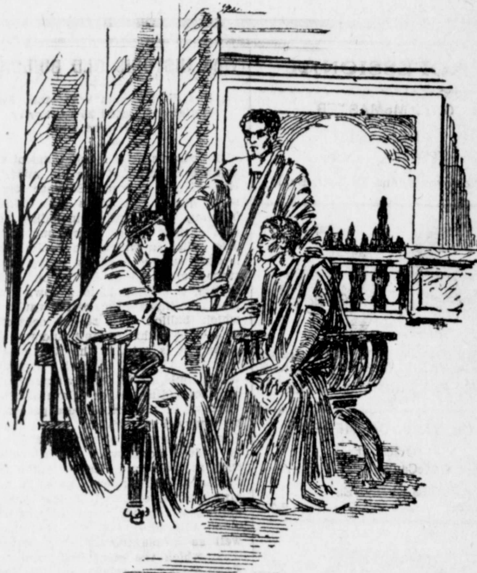
THE ROMAN TRIUMVIRATE.

Patronize your home merchant and help the prosperity of your town and people.