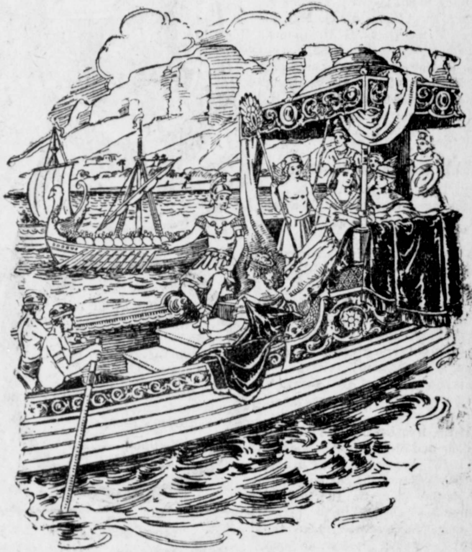
CLEOPATRA CAPTURING ANTHONY.

CLEOPATRA sailed down the Nile and by her personal beauty and the grandeur of her retinue, conquered Anthony and with her charms held him captive until the sighs of Fulvia blew up the fires in the Senate and the Roman government crushed her crown. It is said this Egyptian beauty could, with a smile, change the map of Europe, but with all her subtle charms and native beauty, she is known as the "Serpent of the Nile." Many a beautiful craft of gilded opinions is floating down the political seas and stirs us with the image of its beauty, but, like the "Serpent of the Nile," its influence is degrading and its practices destructive.