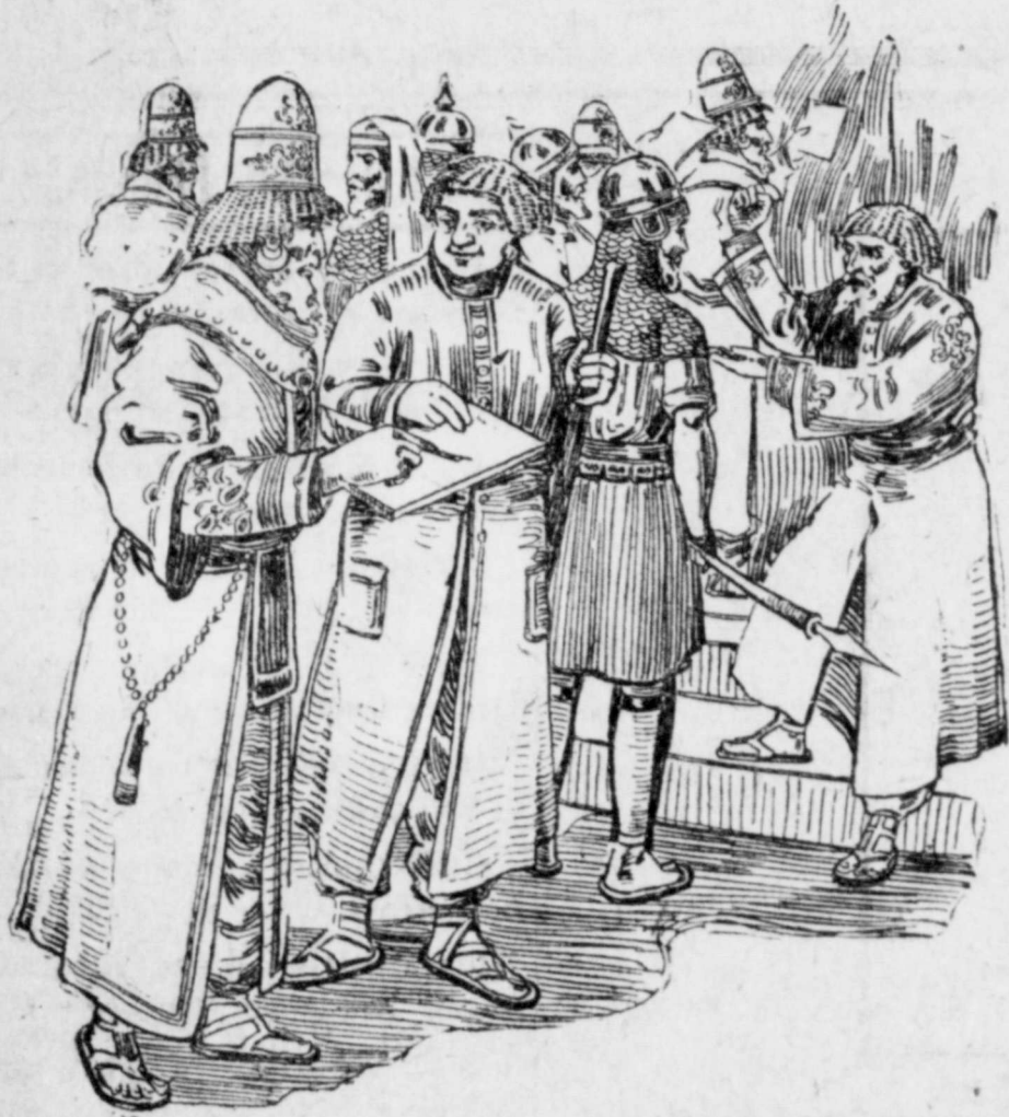
CONDEMNING ARISTIDES THE JUST.

The soul of state is in its people and a narrow, jealous and envious citizenship results in bigoted, revengeful and dangerous leaders and a weak and tottering government.