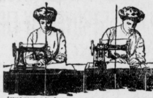
Sitting position for Standard Central Needle Machines. Sitting position for ordinary sewing machines.

ASK your doctor and he will say sew Standard Central Needle way. Come to our store at once and let us show you. No obligation on your part to buy—"just look"