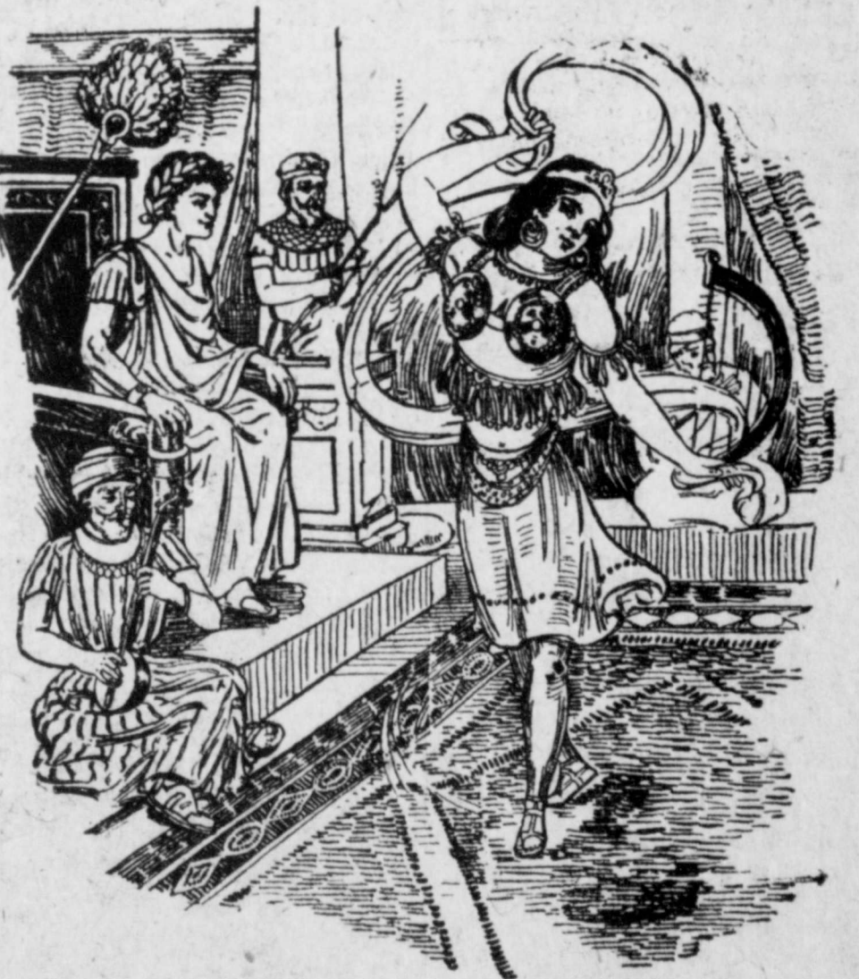
SALOME DANCING BEFORE KING HEROD.

KING HEROD was so well pleased with the dancing of his daughter, Salome, that he offered her half his Kingdom and one of the saddest tragedies in Christendom followed, and his throne toppled and fell. The people of today are oftentimes so well pleased with the vaudeville performance of politicians and the Salome dances of party leaders that they give them the whole of their kingdom, and as a result industries crash, commerce crumbles and pandemonium reigns supreme and the land becomes flooded with "isms" and legislative cure-alls, when the trouble lies in weak leadership. No country can become stronger than its leaders and weak leaders are the pall bearers of its prosperity.