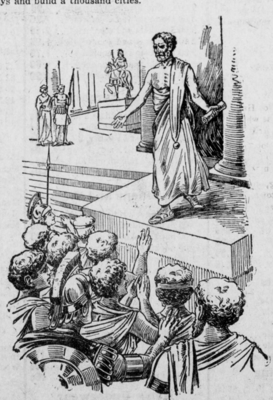
DEMOSTHENES IN ACTION.

HEN Demosthenes was asked to assign three reasons for ACTION, and third, ACTION, and this marvelous Athenan is recognized as the most polished and powerful product of he human race. Since the dawn of history, men of action have moved the world and civilization owes its advances to men who by words and deeds have turned the wheels of progress. An your of action is worth a lifetime of hesitation. Texas needs nen of action to start a million plows, build factories, construct 50,000 miles of railroad, improve 140,000 miles of public highways and build a thousand cities.