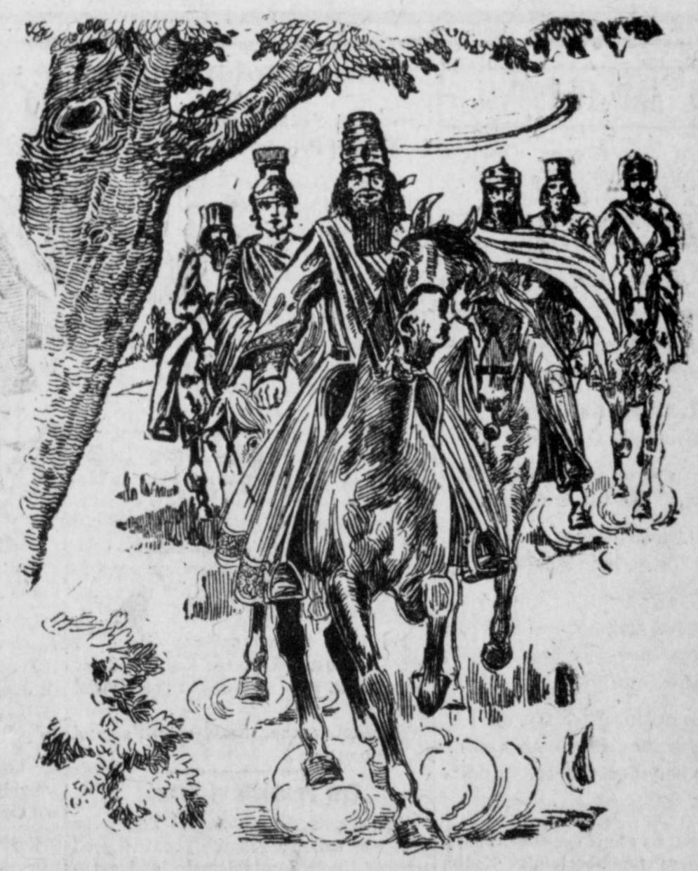
DARIUS MADE KING OF PERSIA.

HE neigh of a horse made Darius King of Persia, the six contending powers for the throne agreeing among themselves that the one whose horse should neigh first should possess the kingdom. This ancient method of settling disputes among politicians could be revived with profit in Texas today. If our partisan factions and petty politicians could only settle their disputes by the neigh of a horse, the bark of a dog or the bray of a donkey, it would be a great blessing for Texas and would give our citizens a better opportunity to pursue the vocations of industry free from political strife.