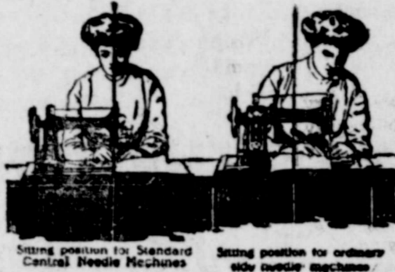
Sitting position for Standard Central Needle Machines. Sitting position for ordinary sewing machines.

When you were doing your sewing, and the