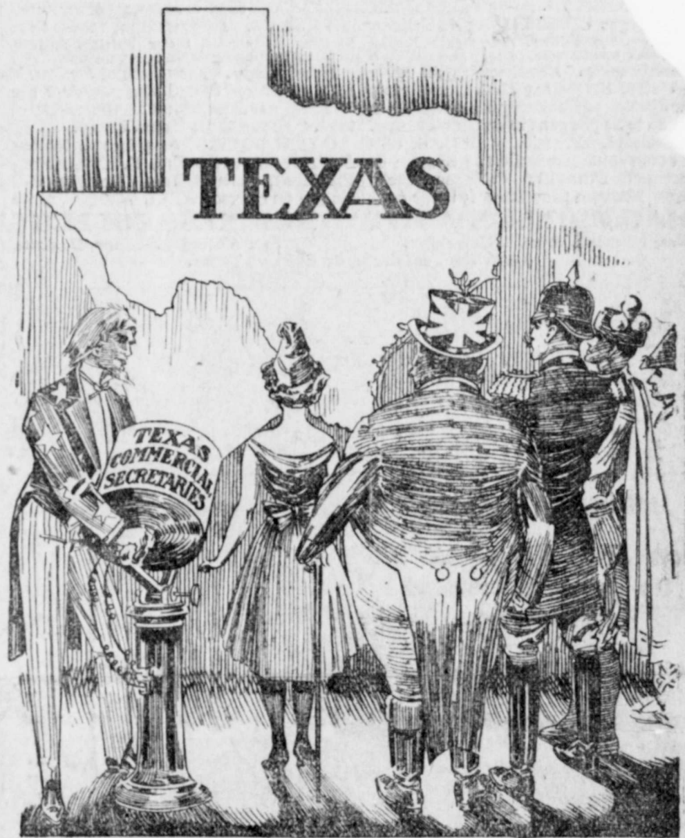
UNCLE SAM TALKING TEXAS

Prosperity always comes to countries that are getting out literature and charging the atmosphere with the presence of the Commercial Secretaries are throwing the resources like a sunbeam across the pathway of civilization.