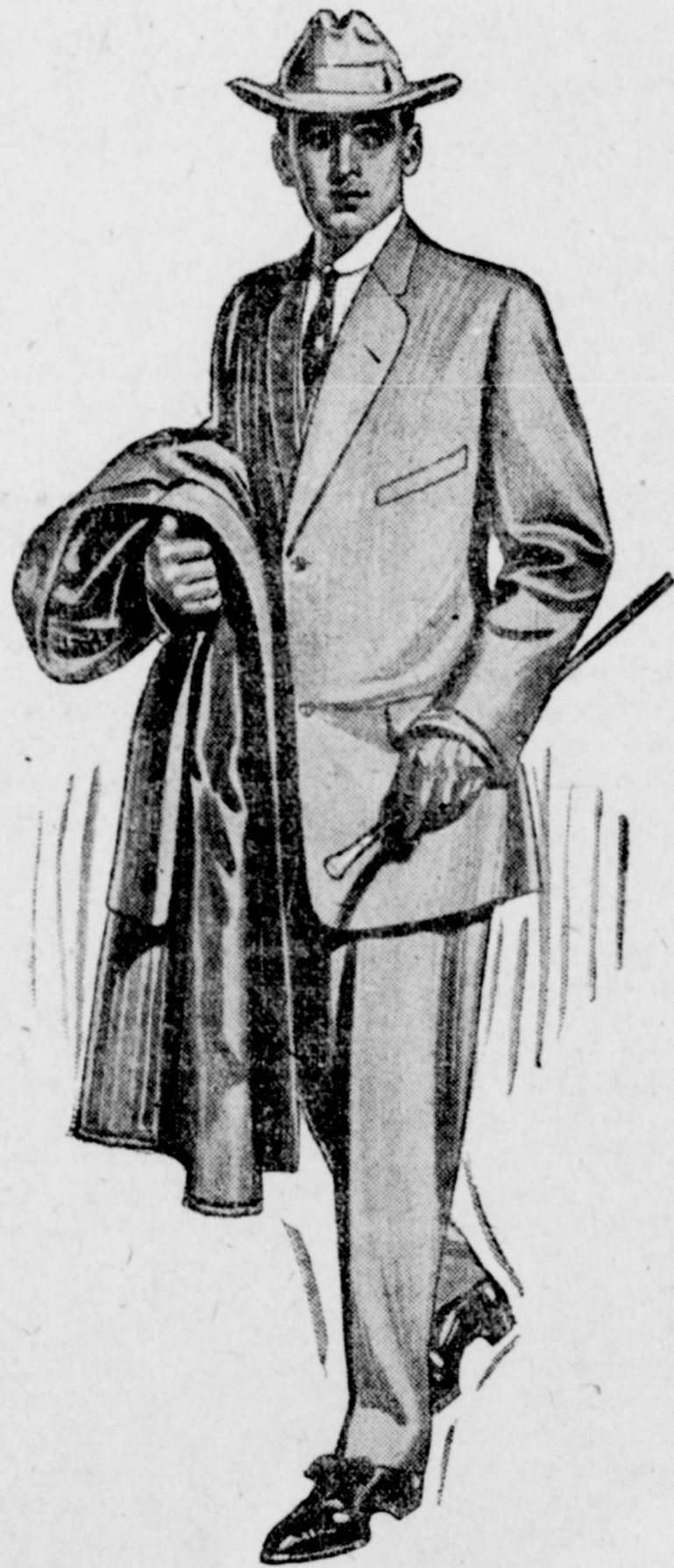
Society Brand Clothes