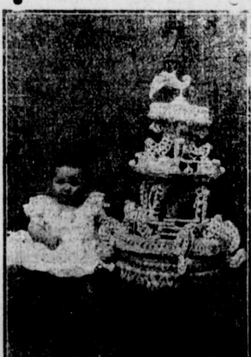
TWO SWEETS RODGERS BAKERY