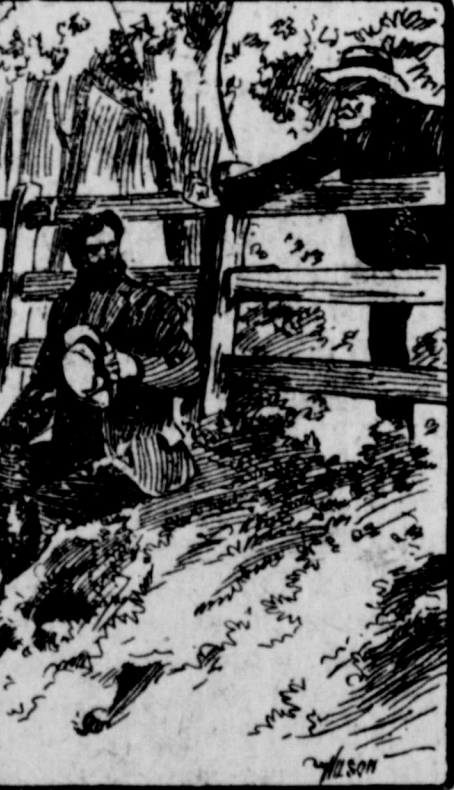
Shook His Fist Across the Fence at

and turned white to the lips. "Not," he said, "not-"Go and see," she answered, and