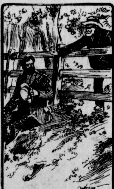
Shook His Fist Across the Fence at

Him. and turned white to the lips. "Not," he said, "not-