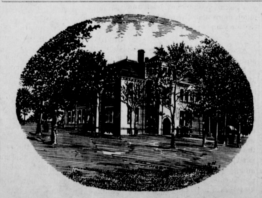
Denton College, from which the Merkel Public School building was patterned.