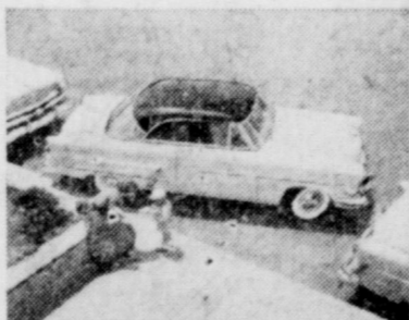
Parking is a pushover... all driving is a lot easier. You can easily turn the wheel with one finger while the car is standing still. At times, up to 75% of the effort you need to steer is supplied for you by Ford Power Steering.