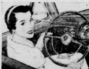
You're safer! Even if a front tire should blow out, Ford Power Steering gives you the "muscle" to keep control. And even if hydraulic pressure is lost (which is highly unlikely) you're right back to conventional steering.