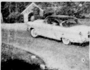
No change in driving habits! You could drive off in a Ford with Power Steering and feel completely at ease from the start. This is because Ford Power Steering has exactly the same ratio as Ford regular steering.

Ford Power Steering has a more natural "feel" and it does up to 75% of the work. You don't have to change your driving habits radically. The steering gear ratio is the same as without power steering and the hydraulic system gives you just the right assistance when you need it.