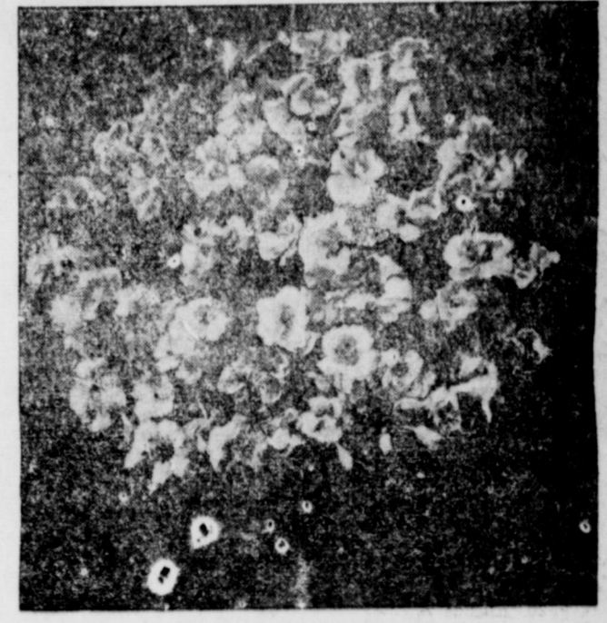
Fragrant Double Dwarf Nasturtiums.

with no flower seed sown, you are covered with flowers in Cali-can sow the following annuals, fornia, along the coast, where which with normal weather winds from the ocean keep tem-