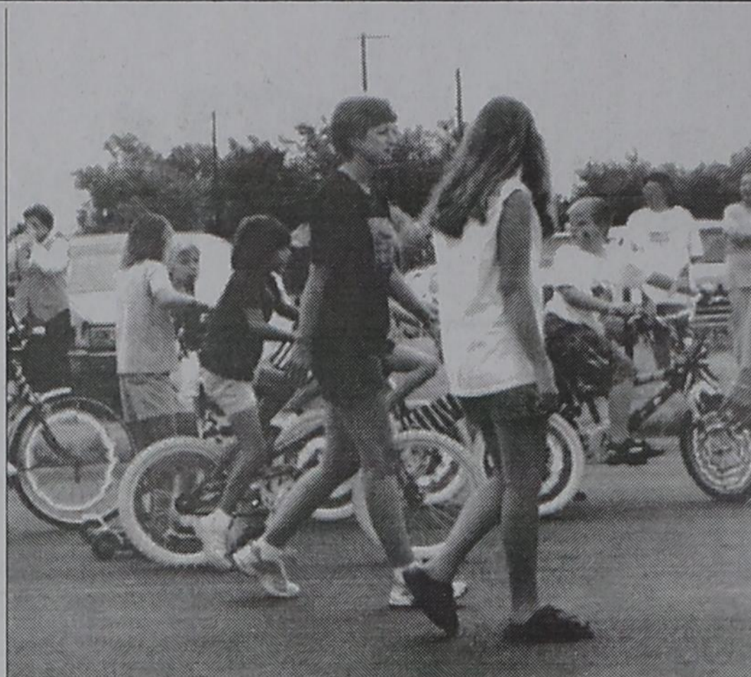
JULY 4 PARADE WALKERS Cattle Feeders Hit Hard...

(Continued from Page 1) TCFA also has initiated an industry wide analysis of the beef industry to be conducted by prominent business schools across the nation. "This systems analysis will give perhaps the clearest and most insightful picture we've ever had of industry structure from producers to consumers and where profit opportunities for producers might be found,"