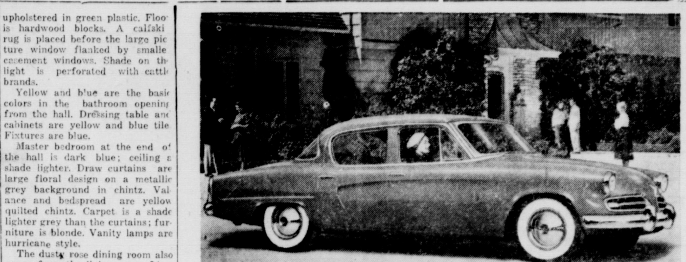
The Studebaker Commander V-8 4-door sedan illustrates the low, sweeping lines characteristic of the company's new 1953 models. Quickly apparent are the "cleanness" of the styling, the use of basic horizontal lines to achieve new contours, and the concave design motif along the sides. Overall length of this model is 198%, height is 60 ½". Twelve color choices are available.

Carl Johnson Dry Goods North Side Of Square