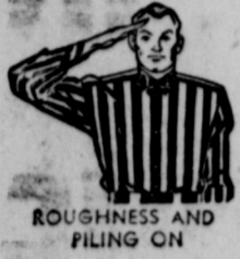
ROUGHNESS AND FILING ON