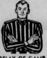
DELAY OF GAME

Warren Motor Company STUDEBAKER Sales—Service