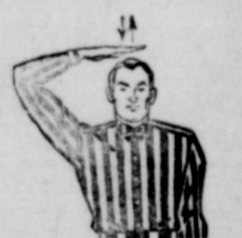
INELIGIBLE RECEIVER DOWN FIELD ON PASS