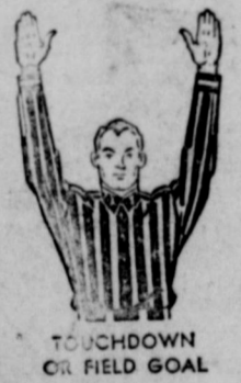
TOUCHDOWN OR FIELD GOAL

Muirhead Motor Company BUICK - PONTIAC Sales and Service