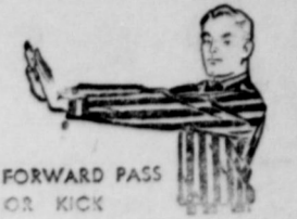
FORWARD PASS OR KICK CATCHING INTERFERENCE