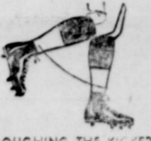
ROUGHING THE KICKER