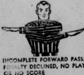
INCOMPLETE FORWARD PASS, PENALTY DECLINED, NO PLAY OR NO SCORE

Banner DAIRIES Helping build West Texas Phone 10