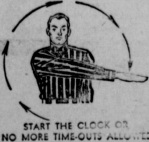
START THE CLOCK OR NO MORE TIME-OUTS ALLOWED