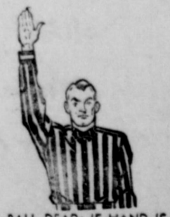
BALL DEAD, IF HAND IS MOVED FROM SIDE TO SIDE TOUCHBACK