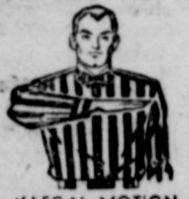
ILLEGAL MOTION OR SHIFT