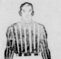
CRAWLING, HELPING THE RUNNER OR INTERLOCKED INTERFERENCE