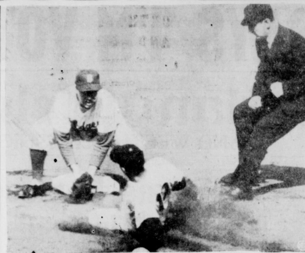
NO STEAL—Phil Rizzuto, Yankee shortstop, thrown out at second on an attempted steal by Dodger catcher Roy Campanella's peg to Pee Wee Reese in the first inning of the second game of the World Series played at Ebbets Field. Rizzuto was the second consecutive Yankee thrown out trying to steal second in the first-inning.

Burroughs Adding Machines and Cash Registers Your choice of 15 models of new machines. Stephens Typewriter Co. 417 S. Lamar St. Eastland Phone 639