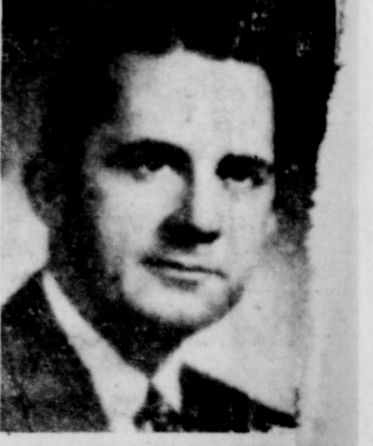
GOVERNOR SHIVERS He ain't a-goin' fishin' November 4th

as it did on the eve of the Communist party Congress opening Moscow Sunday. Stalin said the capitalist tries were trying to save their ten and compared these to a "drowning man clutching straw."