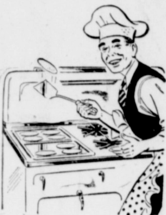
Available in Six Beautiful Colors!

Women are not the only ones who enjoy cooking in a Chambers Range. Men have just loads of fun using the Chambers handy Griddle and In-a-Top-Broiler! If they are not concocting new recipes they're toasting sandwiches. A favorite is making pancakes on the griddle and broiling sausage in the broiler at the same time. These features, plus the Thermowell, Super-Oven, and ThermoOven make Chambers the most popular gas range. Bring your husband in to see it, today!