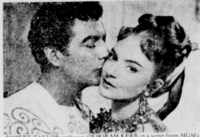
ROBERT TAYLOR embraces DEBORAH KERR in a scene from MGM's tremendous motion picture, "QUO VADIS," in color by Technicolor.