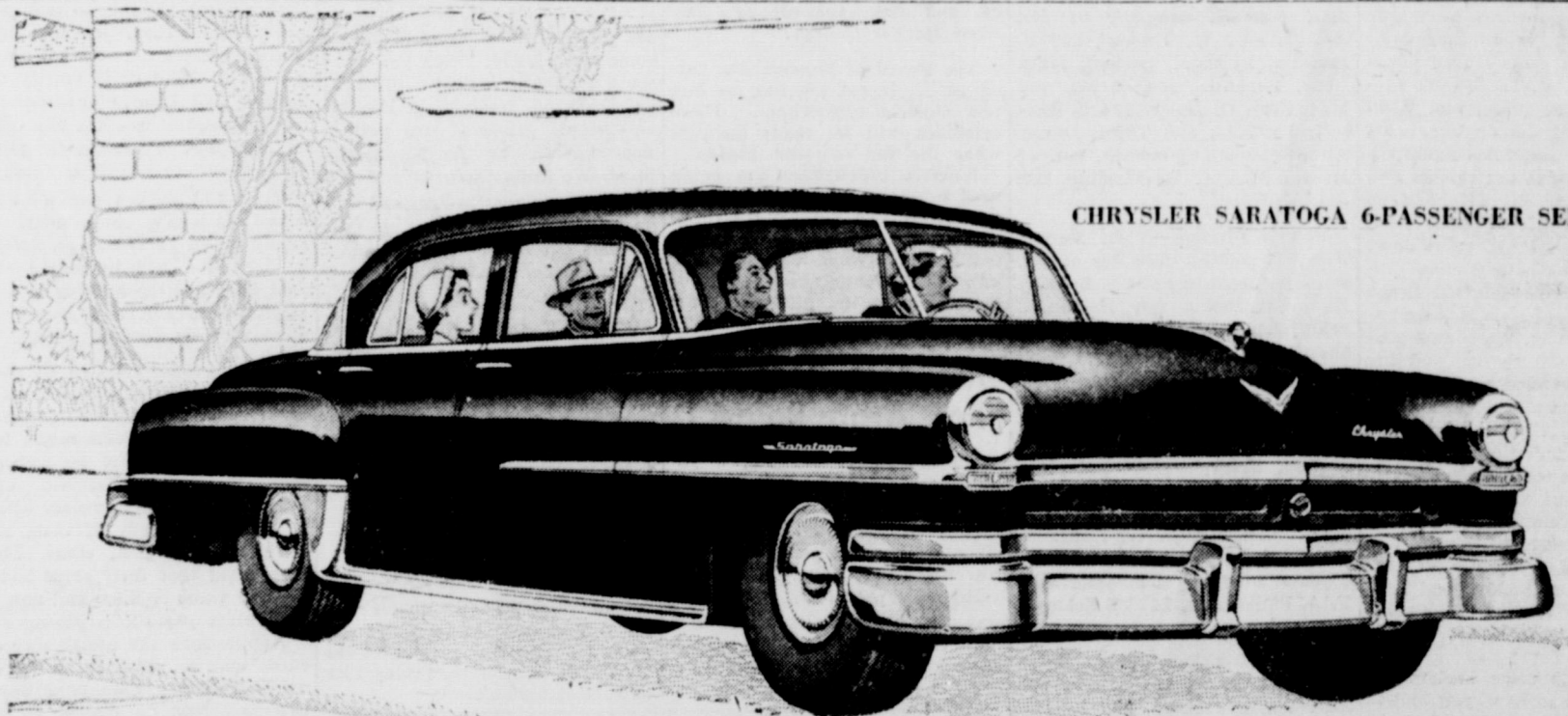
CHRYSLER SARATOGA 6-PASSENGER SEDAN