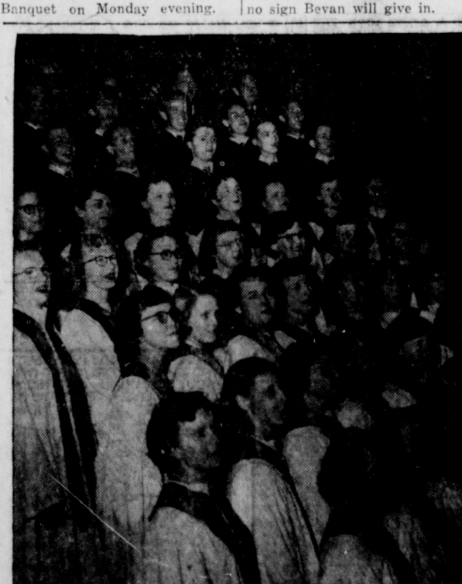
H-SU CHAPEL CHOIR

at 7:30 instead of the regular The measure is expected to be night of Monday. This change is approved by party members in made due to the Father and Son Parliament Tuesday. But there is