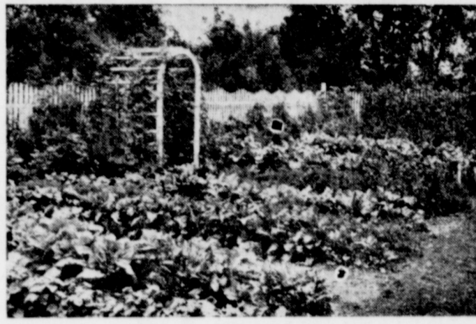
Area 20 x 50 Feet With Fence on East, West and North Gives High Yield.