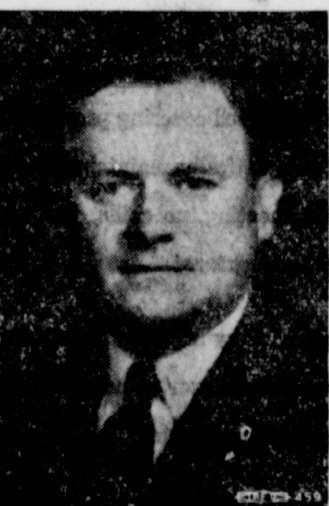
Price Daniel Announces

dition. 2. Reduction of federal spending and "an end to the parade of higher and higher taxes." A pay-as-we-go budget policy with no new taxes "short of total war." 3. Strong preparedness program that will disappoint the Communists through U. S. refusal to spend "ourselves to death." 4. Bi-partisan foreign policy, immediate firing of Secretary of State Dean Acheson. Support of the North Atlantic Security Program, Financial aid only to nations, which are "helping themselves," strengthening of the UN, a campaign to "defeat the enemy or get out of Korea." 5. Opposition to "every-scheme toward further socialization of this country." This includes socialized medicine and the Brannan Farm Plan. 6. An all-out congressional effort to restore the Tidelands to Texas. "I have not accepted that (supreme) court decision as final and never will—this is the biggest steal of them all... The blame for breaking the Texas annexation agreement and seizing our Tidelands falls squarely upon President Truman and those whom he placed in power."