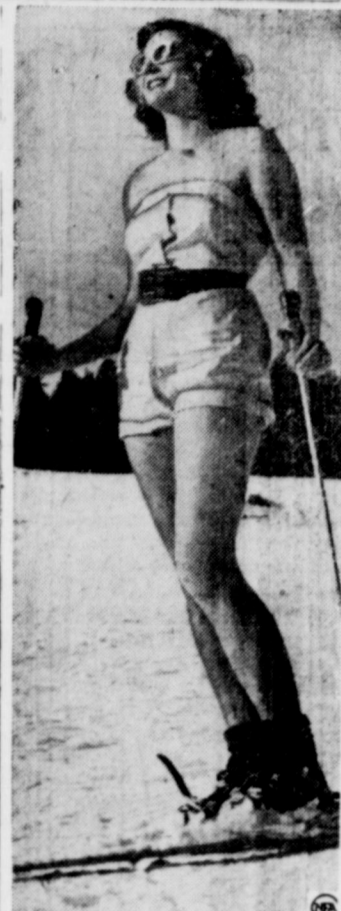
SUN-KISSED SKIER —A curvaceous young miss smiles behind sun glasses as she braves January weather in a sun suit testing the Mt. Sunapee ski run. This is not the recommended ski habit for mislady in New Hampshire's State Park at this time of the year. The sun is not guaranteed.