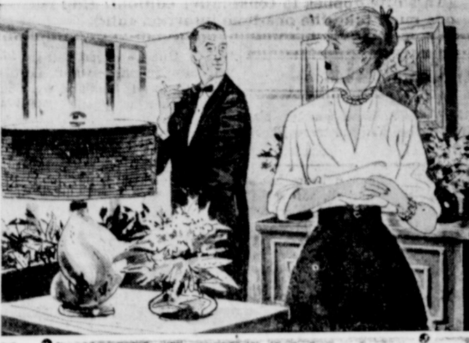
"I wouldn't be at The House at all, if it hadn't been for your influence and your doddering grandfather's."

Well, this time she would refuse to go. She could not sit there and suffer the sight of her man cheapening himself—not again—never again even though it meant the first voluntary separation during the five years of their marriage. Her hand trembled as she picked up the receiver, but it was not